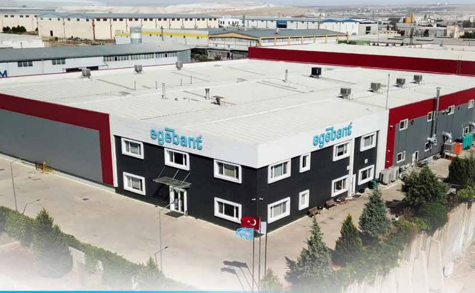
Kocaeli Factory & Headquarter